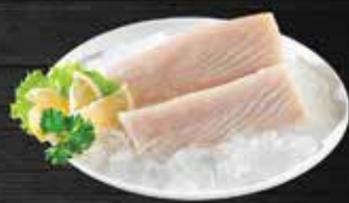
Kingfish Portion Cut