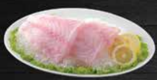
Grouper Portion Cut