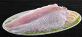
Goldband Snapper Natural Cut