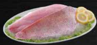
Snapper Natural Cut